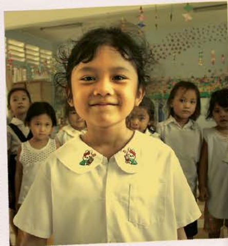
First Vision Trip! Mexico 1981